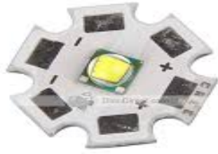
White LED used in lighting industry