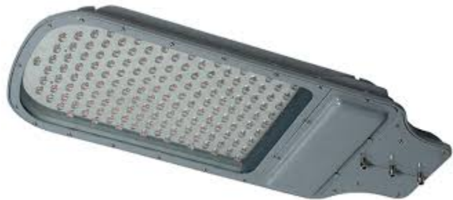
LED Street light fixture

As noted earlier, the blue light content of digital displays is well below that of street lights. Typical LED street lighting fixtures create white light using a high energy blue LED combined with a phosphor coating that together blend to create white light. Digital Billboards use a combination of three separate LEDs (Red Green and Blue) to create white light. Typically the percentage of blue light in an “RGB LED” white image is less than 12%.