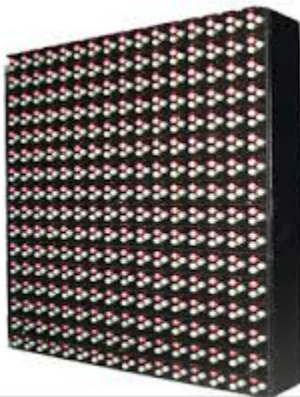
Digital billboard module

A picture of a typical digital billboard module which shows the array of red, green blue diodes that can be combined to create a white image is shown below. These RGB LEDs can produce billions of color variations. This can be contrasted with the image of the White LEDs used in most street lighting applications. These LEDs produce on one color: white.